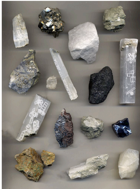
Figure 2. Bethany Rigby – Satellite Minerals (2017).

Bethany Rigby who previously picked up on Sloterdijk's term, using it as the title of a research project that sought to counter what she describes as 'the removal of satellite imaging from environmental responsibility' (Rigby, 2017) by connecting satellites to their material beginnings in quarries and mines. By researching the manufacture of a satellite's components, Rigby made a list of 26 minerals essential to their construction and the sites of their extraction. In her series Mineral // Mine , photographs of mineral samples are paired with magnified satellite images of the mine where they originated, demonstrating a visual correspondence of micro and macro perspectives. More recently, Rigby has assembled a collection of these Satellite Minerals (Figure 2), samples of rock obtained from global mining companies, and laser etched them with the GPS co-ordinates of their origin or diagrams of the satellites they might otherwise have become. Since Sloterdijk's coinage of inverted astronomy in 1990, the epistemic functions of satellite imagery have expanded considerably and the aerial view is so widely available that today the general public can access and download multispectral images of the entire planet, updated daily.