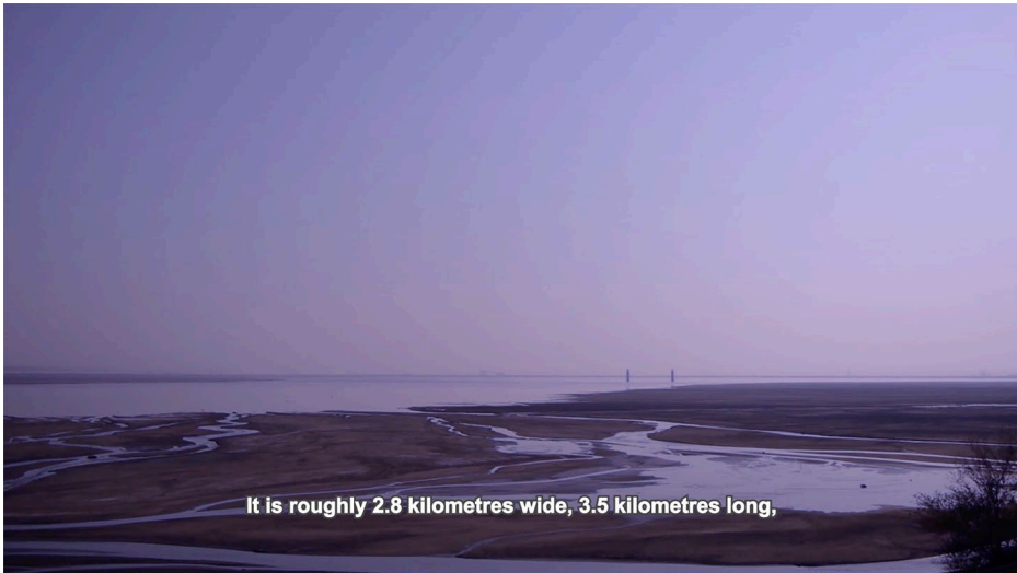
Figure 3. Still from Robert McDougall – Rare Earth (2021). Reproduced with permission.

Faced with these statistics, in which the volume of waste products from rare earth manufacture are 50 times the volume of the metals produced and heavily contaminated with uranium and thorium, it is difficult not to see the technical capacities these elements enable as pyrrhic – coming at such a vast ecological cost that their use value should perhaps be called into question, or at the very least accounted for and regulated. This ratio of 50:1 for rare earth elements gives us some sense of the scale of the inverted cone of perspectival vision I invoked earlier, and yet this accounts only for the relationship between product and waste material at the site of refinement, excluding the material footprint at Bayan Obo where the raw materials are mined, the emissions generated in both processes and the shipping of raw materials. And all this is before any functional object has even begun to be manufactured. In her book Rare Earth Frontiers (2017), geographer Julie Klinger describes places like the Weikuang Dam tailings as ‘sacrifice zones’, writing that ‘the destruction of landscapes and lives in pursuit of rare earth mining has generally been considered a fair price to pay, generally by those who do not live in the sacrifice zone’ (p. 12).