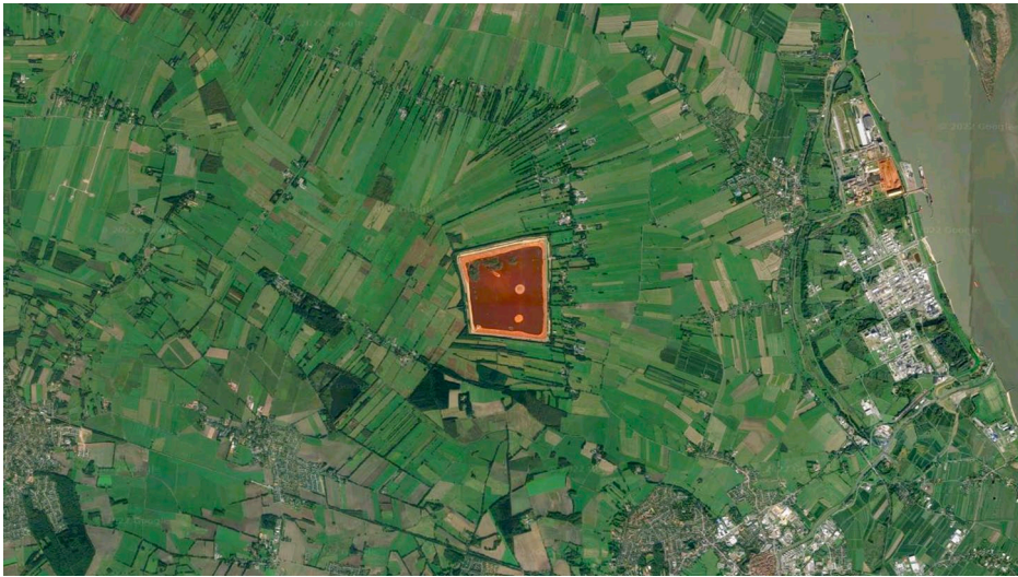
Figure 1. Google satellite image of the Rotschlammdeponie in Northern Germany.

red mud is only 1 m deep then it would contain approximately 1 million tonnes of Bauxite waste, the discarded by-product of Aluminium Oxide refinement at AOS Stade 10 kms to the east. Gazing down at the google maps satellite image of this region, reproduced on my laptop screen at a resolution of 4,096,000 pixels, I see a landscape transformed from environment to image, a process of visualization that Lisa Parks (Parks and Walker, 2020: 8) has referred to as 'digital approximations of remote realities'. Species of foliage are enumerated into various chromatic hex codes of green, homes are folded into its gridded grain. The laptop screen on which I watch this locality become an image is encased in 'space-grey' brushed aluminium, which was once refined from Bauxite.